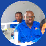
Ndlovu Bimma Transport and Logistics